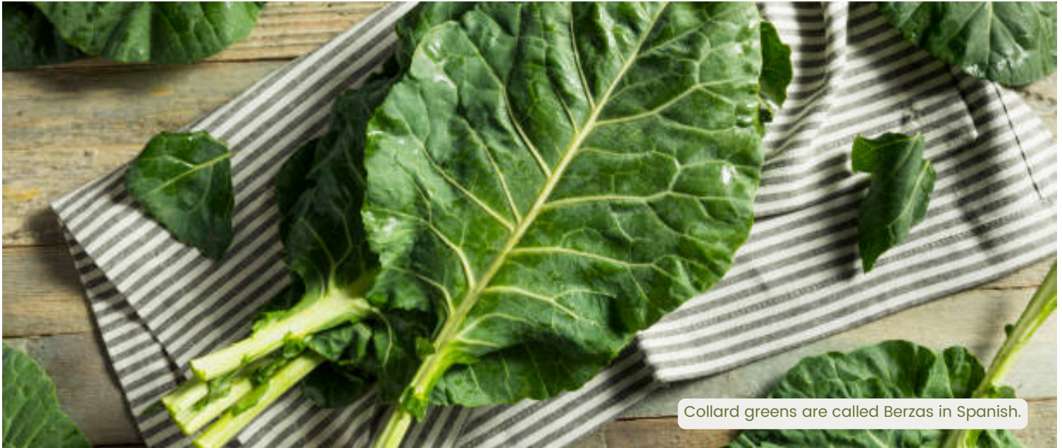
Collard greens are called Berzas in Spanish.

A hardy, nutritious green that symbolizes resilience, heritage, comfort, and good fortune!