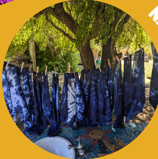
NATURAL TIE DYE