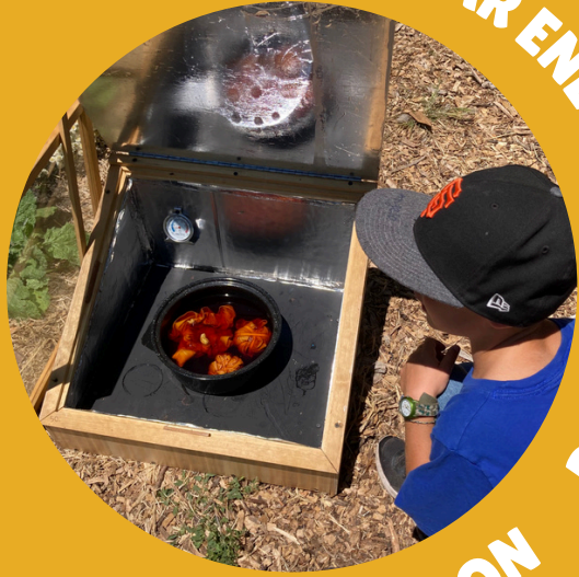
SOLAR ENERGY COOKING