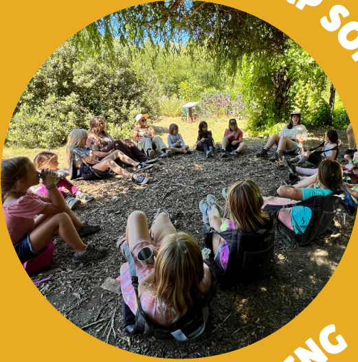
CAMP SONGS & GAMES